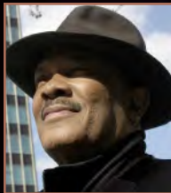
Superstars of Fusion