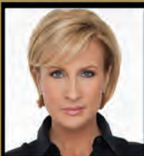
MIKA BRZEZINSKI Author and Journalist: "Knowing Your Value"