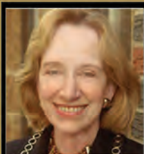
DORIS KEARNS GOODWIN Presidential Historian