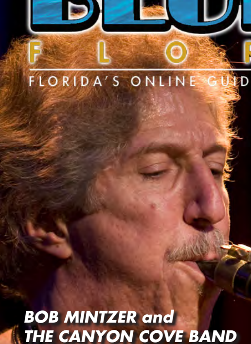
BOB MINTZER and THE CANYON COVE BAND

FLORIDA'S ONLINE GUIDE TO LIVE JAZZ & BLUES