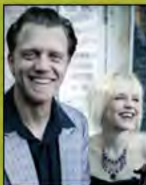
JANUARY 14 Nouveaux Honkies