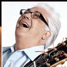
LARRY CORYELL TRIO