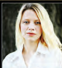
VALENTINA LISITSA Pianist, with the Lynn University Philharmonia