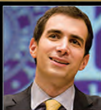
ANDREW ROSS SORKIN Author and Journalist: "Too Big To Fail"

FESTIVALOFTHEARTSBOCA.ORG • Call for info: 561-368-8445