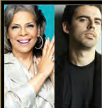
An Evening of Gershwin PATTI AUSTIN and TONY DESARE