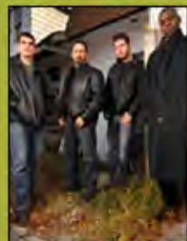
JANUARY 6 Howard & The White Boys