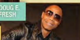
DOUG E. FRESH

MARCH 17 TH - 18 TH 2012 AT SUN LIFE STADIUM