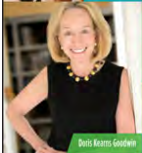
Doris Kearns Goodwin