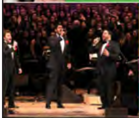
FORTE (From America's Got Talent)