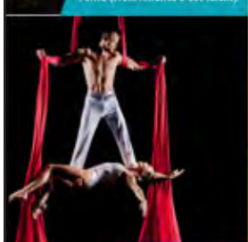
Cirque de la Symphonie