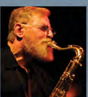
Saturday 11/01/2014 8:00 PM Lew Tabackin | Jazz