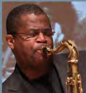
Saturday 12/13/2014 8:00 PM Ray Blue | Jazz