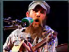
DEC 21 SOUTHERN ROCK'S FINEST

With former members of: BLACKFOOT PURE PRAIRIE LEAGUE GHOST RIDERS FIREFALL MARSHALL TUCKER BAND