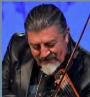
Saturday 12/06/2014 8:00 PM Vitali Imereli | Jazz