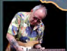
DEC 7 JIMMY THACKERY & THE DRIVERS