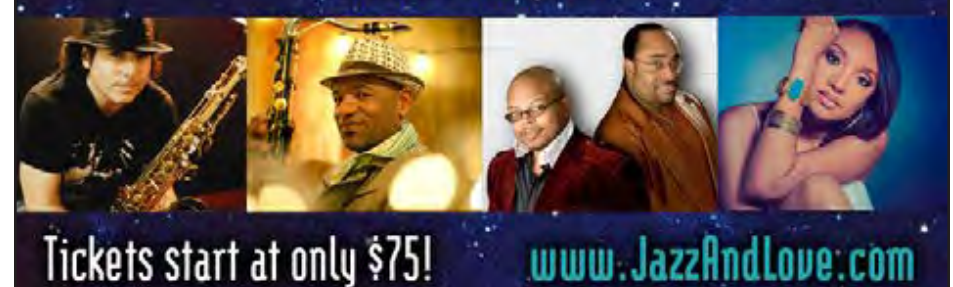
CHART-TOPPING CONTEMPORARY JAZZ BAND PIECES OF A DREAM POWERHOUSE VOCALIST/PIANIST SHELEA FRAZIER